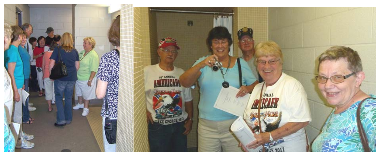
The guys join us in the girl's locker room. Private shower stalls now! Lots of giggles reminiscing.