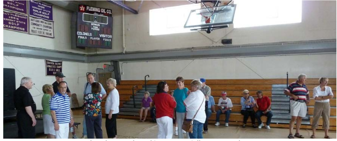
Note that the scoreboard is commercially sponsored.

Some banners in the gym. The 1961 State Baseball banner is not on display. No trophy cases in the hall either.