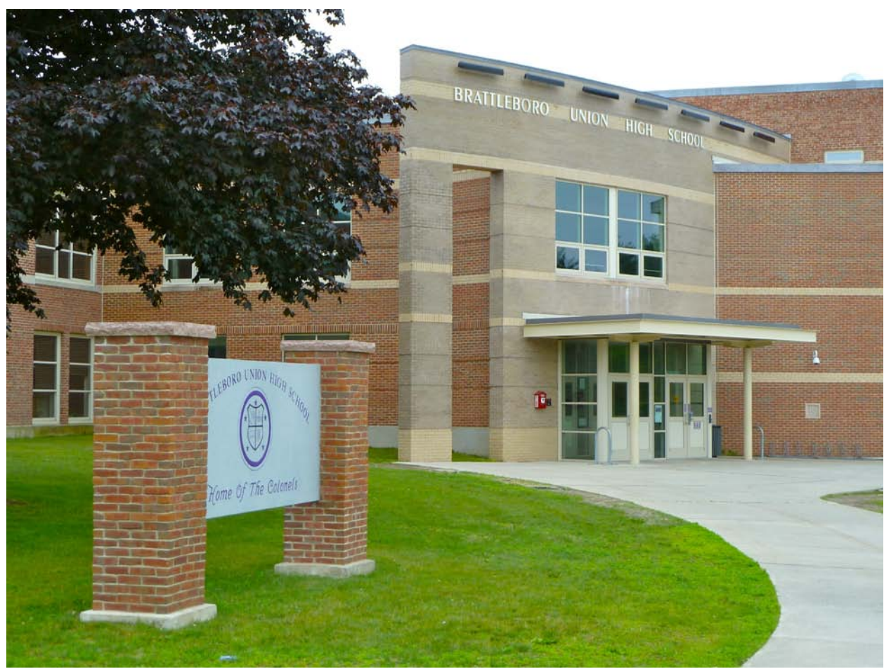
The new front entrance is on the right side. High security entrances/exits.