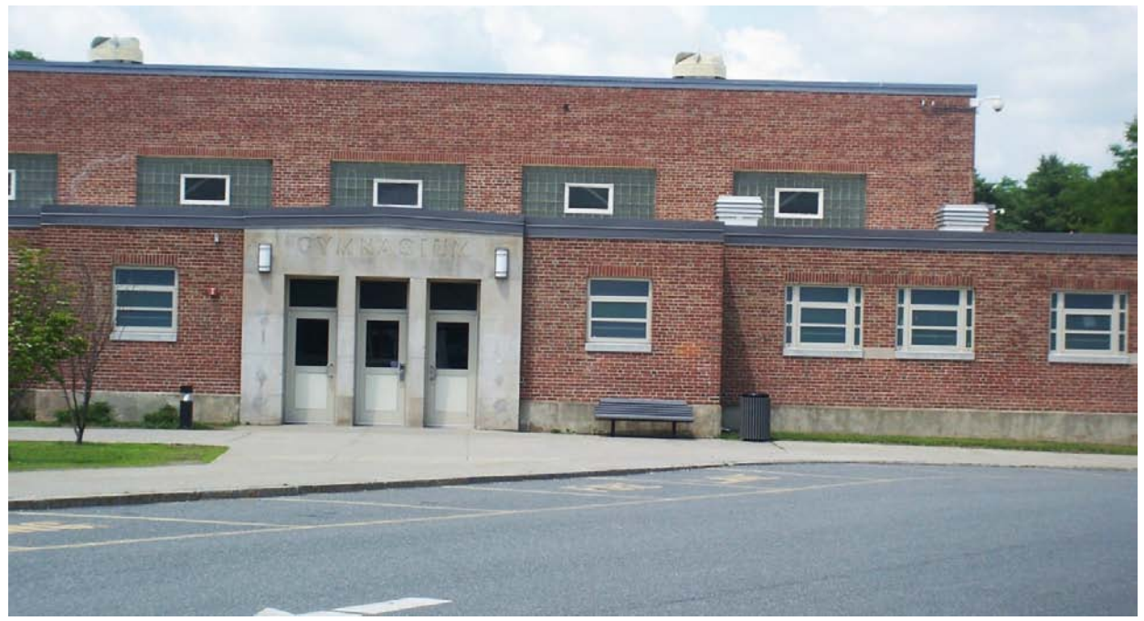
The entrance to the gymnasium is in the same place