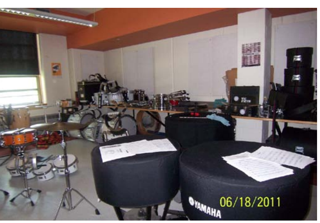
Percussion Instruments in the band room