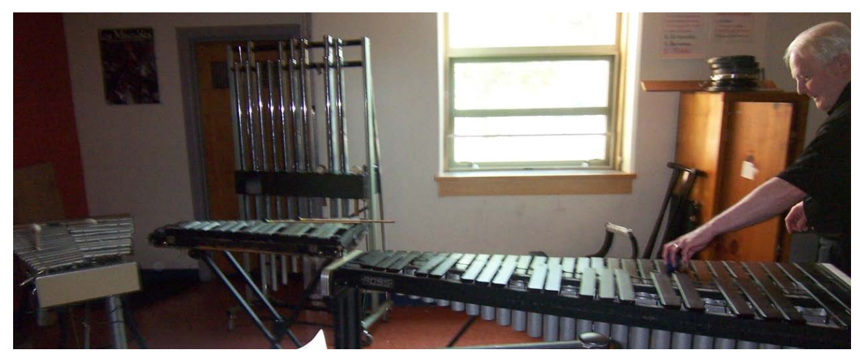
More percussion instruments