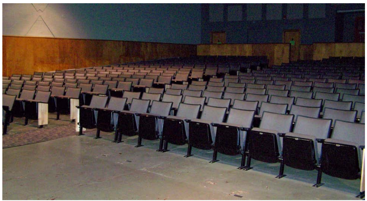
Would you believe padded seats in the auditorium?