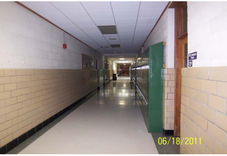
Lockers in the hallway to the Junior High building